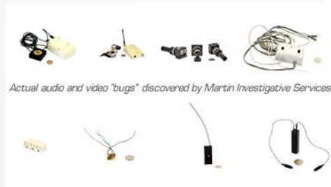
Actual audio and video "bugs" discovered by Martin Investigative Services.

When your intuition tells you something is wrong, you are usually correct. Perhaps you suspect an employee of workers' compensation fraud. Maybe you suspect a cheating spouse. You need proof, but more importantly, you need proof that will stand up in court. Our investigators are trained to perform discreet surveillance and provide court-admissible evidence of wrongdoing.